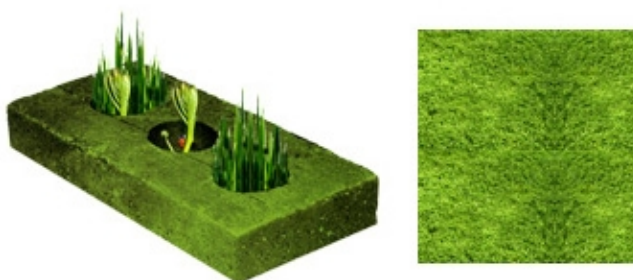
Illustration A- Green Brick The illustration above is not representative of the final product

Infrastructure would classify as a key "growth" symbol within a city. The intent of this research is to create a green tipping point through the design and practical use of green "bricks", thereby creating ubiquitous green clusters within a city. The vision goes beyond manicured lawns, horticultural imports, bonsai's and golf parks. The proposal strives to bring back native plants at the core of our daily life by integrating them with the built form and other symbols of 'growth' within a city.