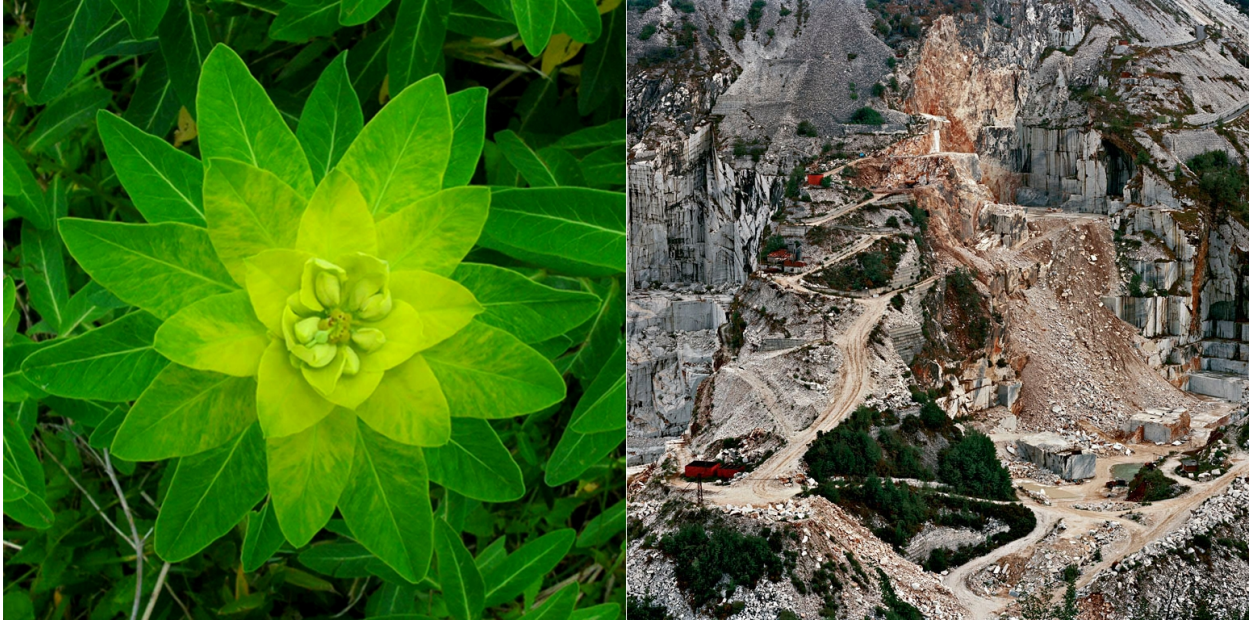
First bloom, India, 2005

key words: emergent technologies, sustainable design, responsive architecture, intelligent materials, human plant interaction, biomimetics, modular tiles